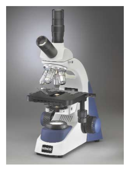
G382 with Dual Head